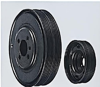
06B 105 243D