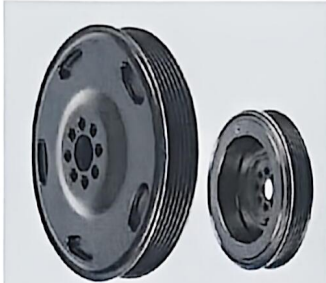
06E 105 251C