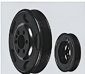
06F 105 243J